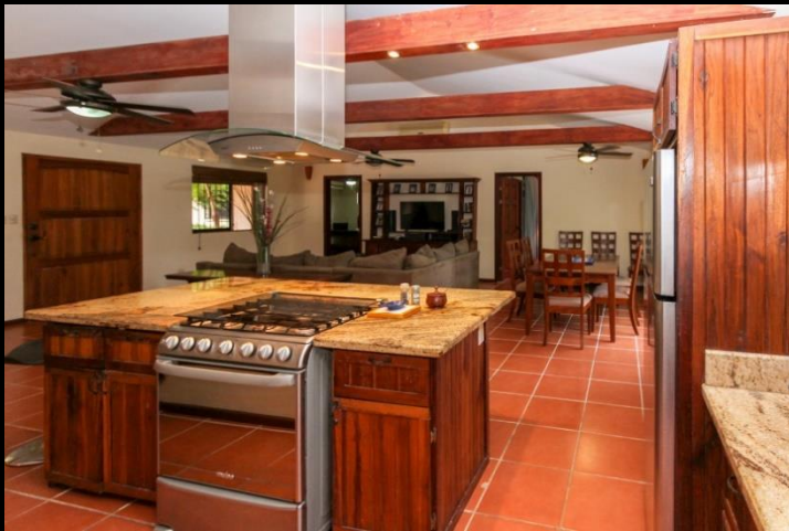
Open Floor Plan Living