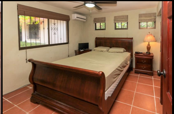
Second Bedroom w/ Jack and Jill Bath