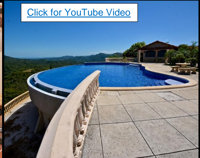
Community Pool and Club House