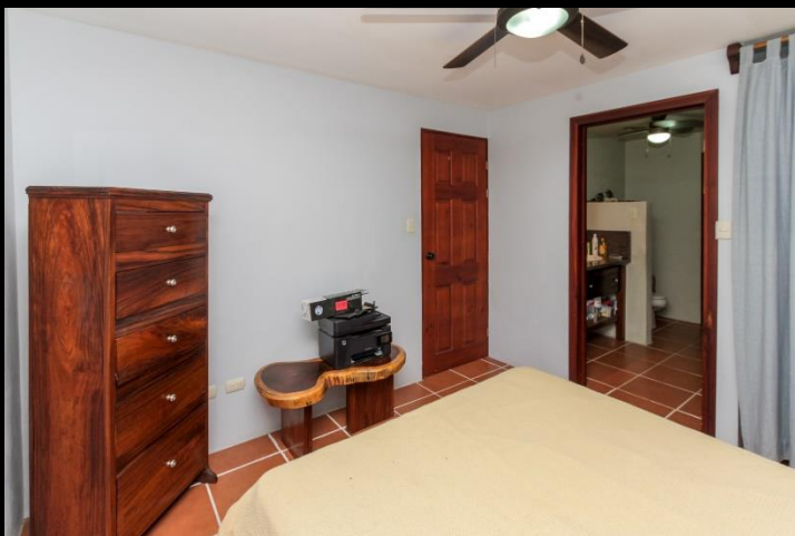
Third Bedroom w/ Jack and Jill Bath