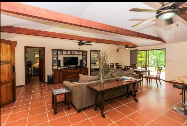
Large Open Living Floor Plan

A horse lovers dream! Be part of a six-hundred-acre development of Lomas Del Mar, that features a full service equestrian center, miles of natural trails, huge mountain top infinity edge community swimming pool and clubhouse. This single level ranch style home features over 2000 square feet of living space with an open dining, living, kitchen concept. Three bedroom and 2 bathrooms with the master featuring en-suite bath. The home sits at the back of the property on a gentle knoll with ample room to expand should you desire. The Lot measures over 2.3 acres and has many tropical plants and trees. In addition, there is a cover carport and separate work/storage room. The home is only 40 minutes from the Liberia international airport and minutes to the beach and service. This home is priced to sell at $245,000.00