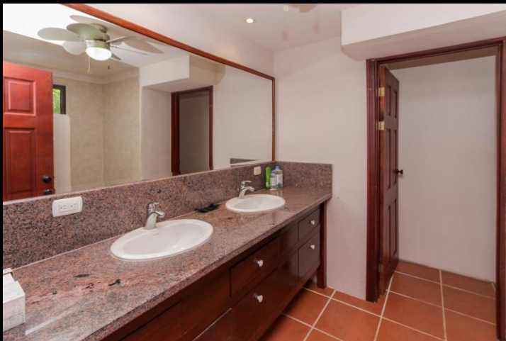
Master Bath w/ Double Vanity and Granite Tops