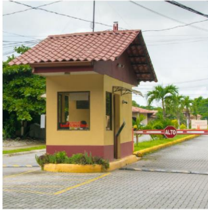
Secure & Gated Community