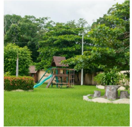
Park & Playground