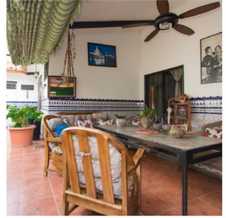
Covered Outdoor Living