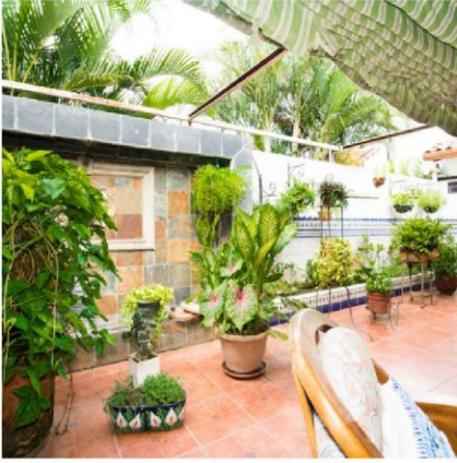
Imported Spanish Tile