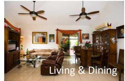
Living & Dining