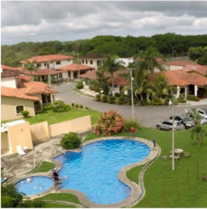
Pool & Jacuzzi